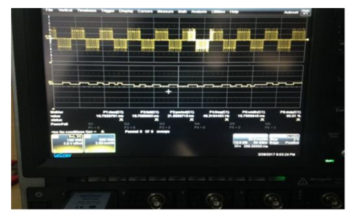
Fig 4:- Output Waveform

Output voltage in multi meter is found as 75v.