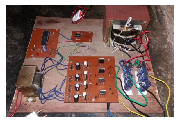
Fig 2:-Hardware Model

A 230v AC supply is given to the primary of transformer and at the secondary side we are having five tapping. Across each tapping we get 0-15v. This 15v supply is given to the bridge rectifier which convert AC-DC. The 1000uf capacitor is used as a filter and to remove the ripple 0.1uf capacitor is used. Then the 7805 IC is connected to regulate the voltage. Then this 5v DC supply is given to the Microcontroller 89C52.